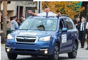
Butler Veteran's Day Parade.